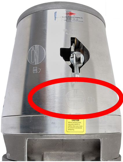
C2 HAS NO HOLE IN COVER