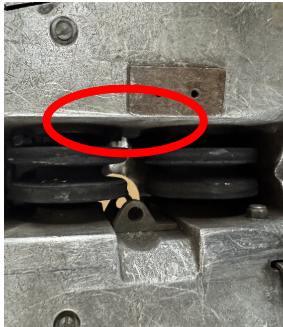
J HAS NO STRAND TENSION ROLLER GUIDE