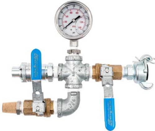
P/N 89643 Pressure Valve Assembly

Create your own kit , using the components below and the Carry Case