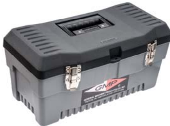
P/N 89820 Carry Case