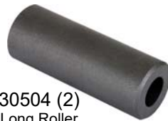
30504 (2) Long Roller (2) 26669 Bushings Req.