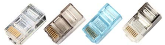
L to R: 25127 (clear), 24062 (gray), 17188 (blue), 24042 (shielded)